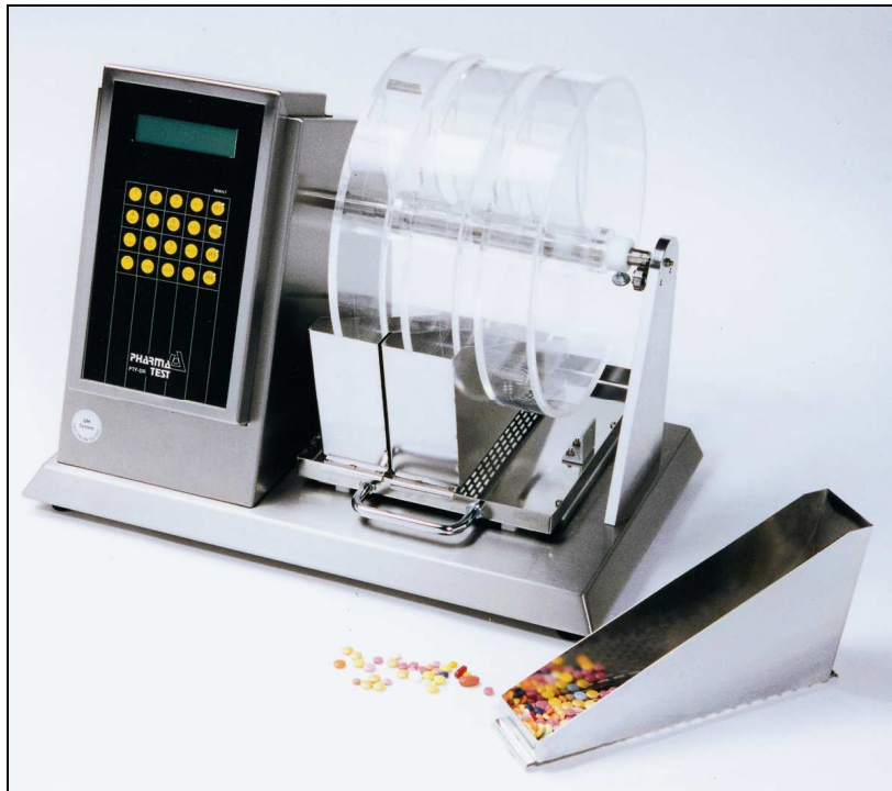
PTF 30ERA includes 3 off Friability Drums

Net weight: 21 kg Gross weight: 28 kg Packaging: 650 mm x 470 mm x 690 mm